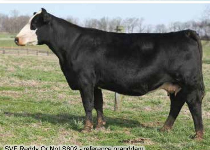
SVF Reddy Or Not S602 - reference granddam