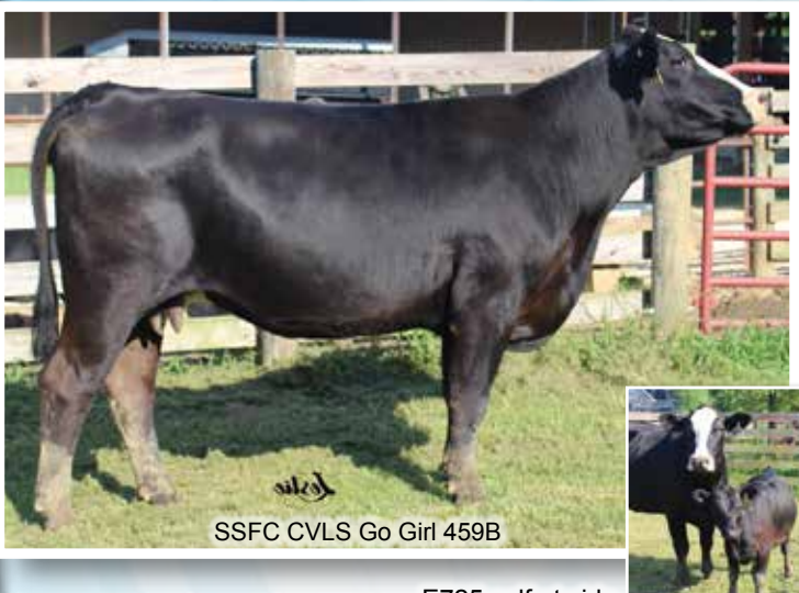
E725 calf at side